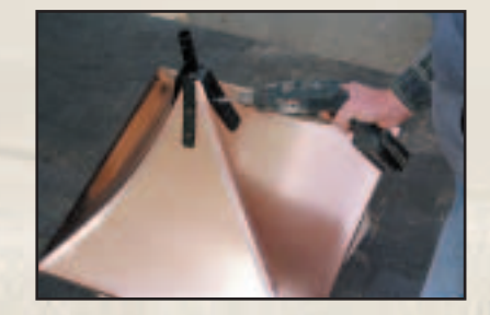
Attach weathervane. Paint or stain the cupola.

CW Ohio reserves the right to change specifications without notice