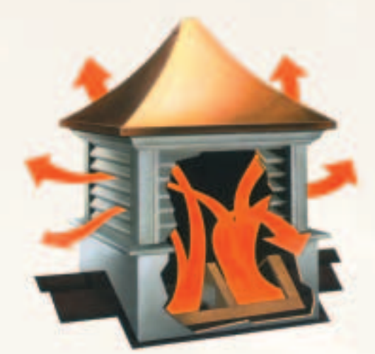
Designed for natural ventilation to reduce damaging hot air and condensation

Ventilate warm moist air up and out of the attic through the generous louver panels and stop worrying about wood rot, mildew, peeling paint, and musty odors. Stephenson Cupolas even help prevent ice dams in rain gutters by evacuating under-roof moisture. Install and forget—no ventilator fans to wear out, no electrical wiring to install and maintain.