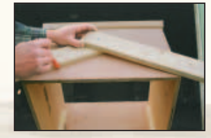
Use the marked pieces as a template for notching the cupola base so that it fits the roof.